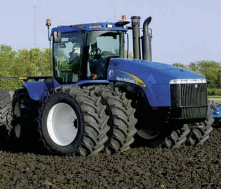
Off-road application in CNH 4x4 tractor with Iveco 13 TCD Cursor engine